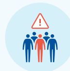
AVOID CROWDED AREAS