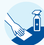
DISINFECT SURFACE AREAS