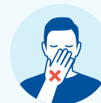
DON'T TOUCH EYES, NOSE OR MOUTH